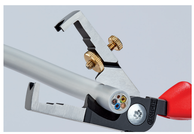
Induction hardened shear blade with precisely ground cutting edges for crushing-free cutting of copper cables up to Ø 15 mm (5 x 2.5 mm²)